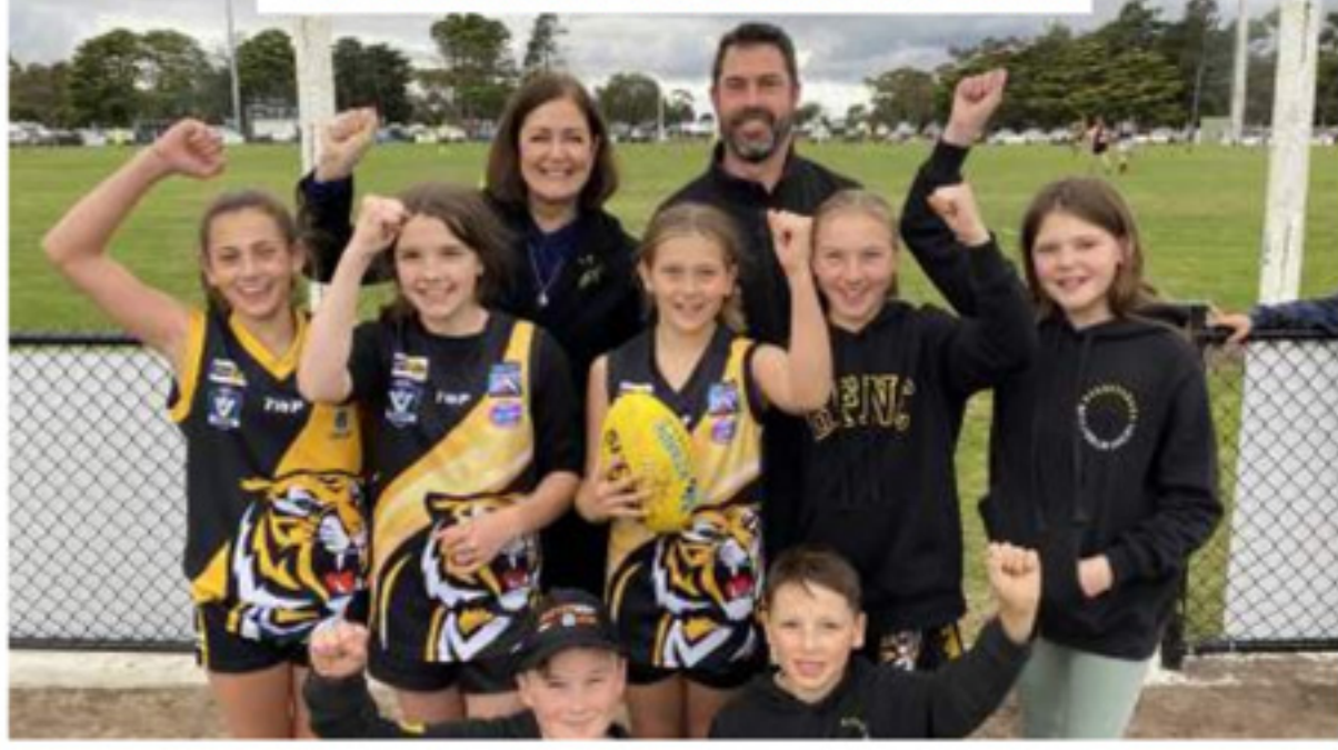
VICTORIA PARK LIGHTING UPGRADE BANNOCKBURN