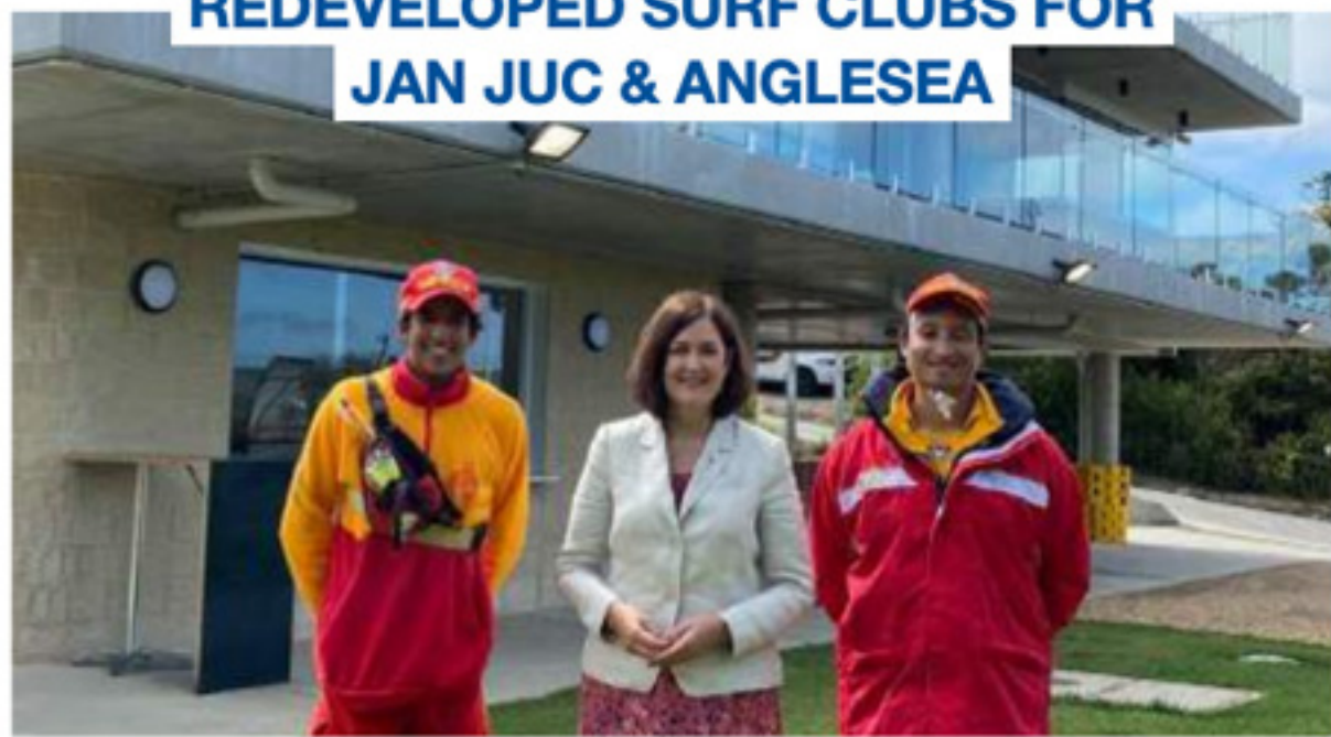
REDEVELOPED SURF CLUBS FOR JAN JUC & ANGLESEA