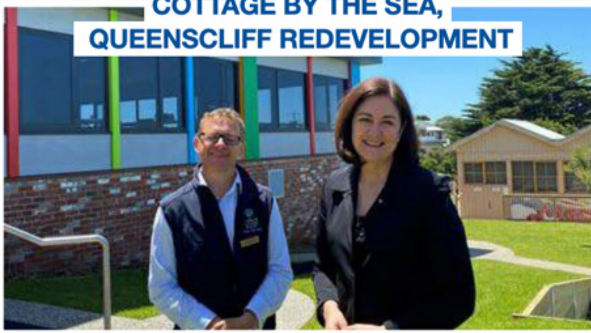
COTTAGE BY THE SEA, QUEENSCLIFF REDEVELOPMENT