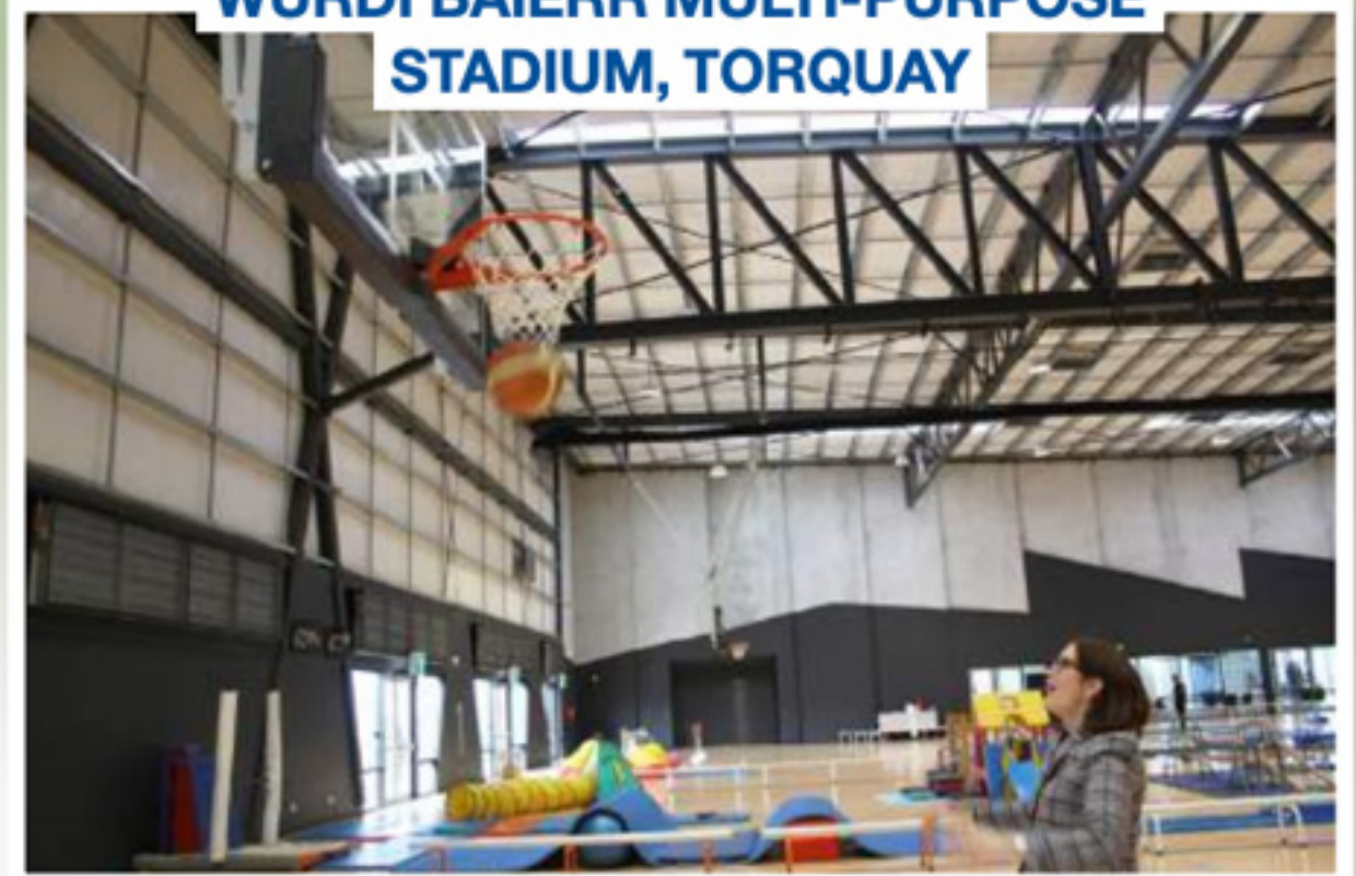
WURDI BAIERR MULTI-PURPOSE STADIUM, TORQUAY