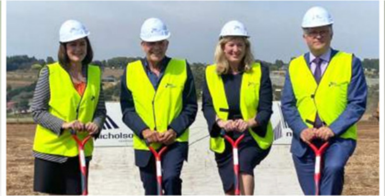
ANAM CARA HOSPICE CONSTRUCTION BEGINS