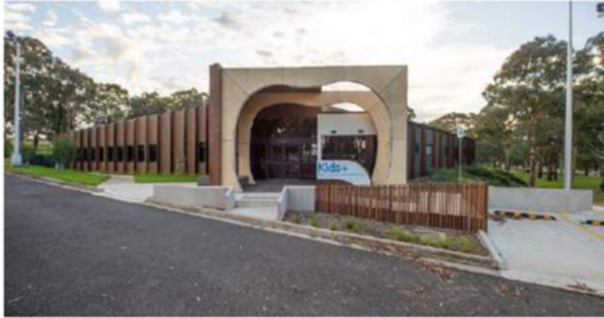
KIDS PLUS DISABILITY CENTRE, WAURN PONDS