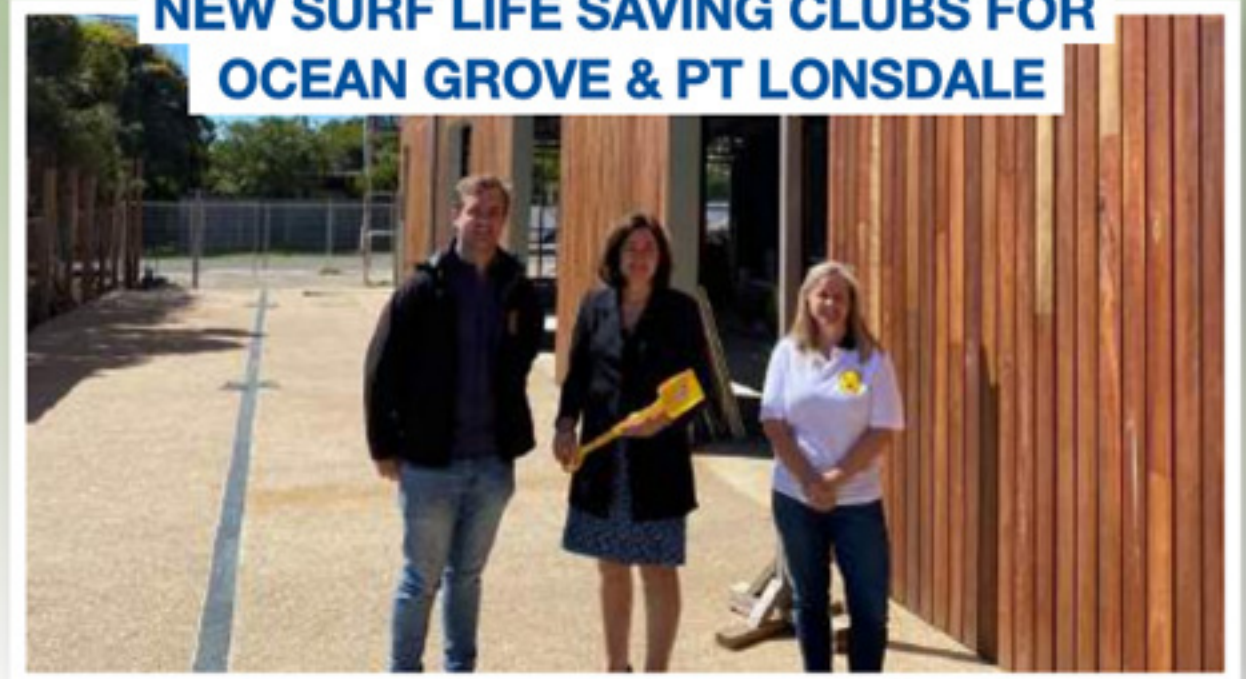
NEW SURF LIFE SAVING CLUBS FOR OCEAN GROVE & PT LONSDALE