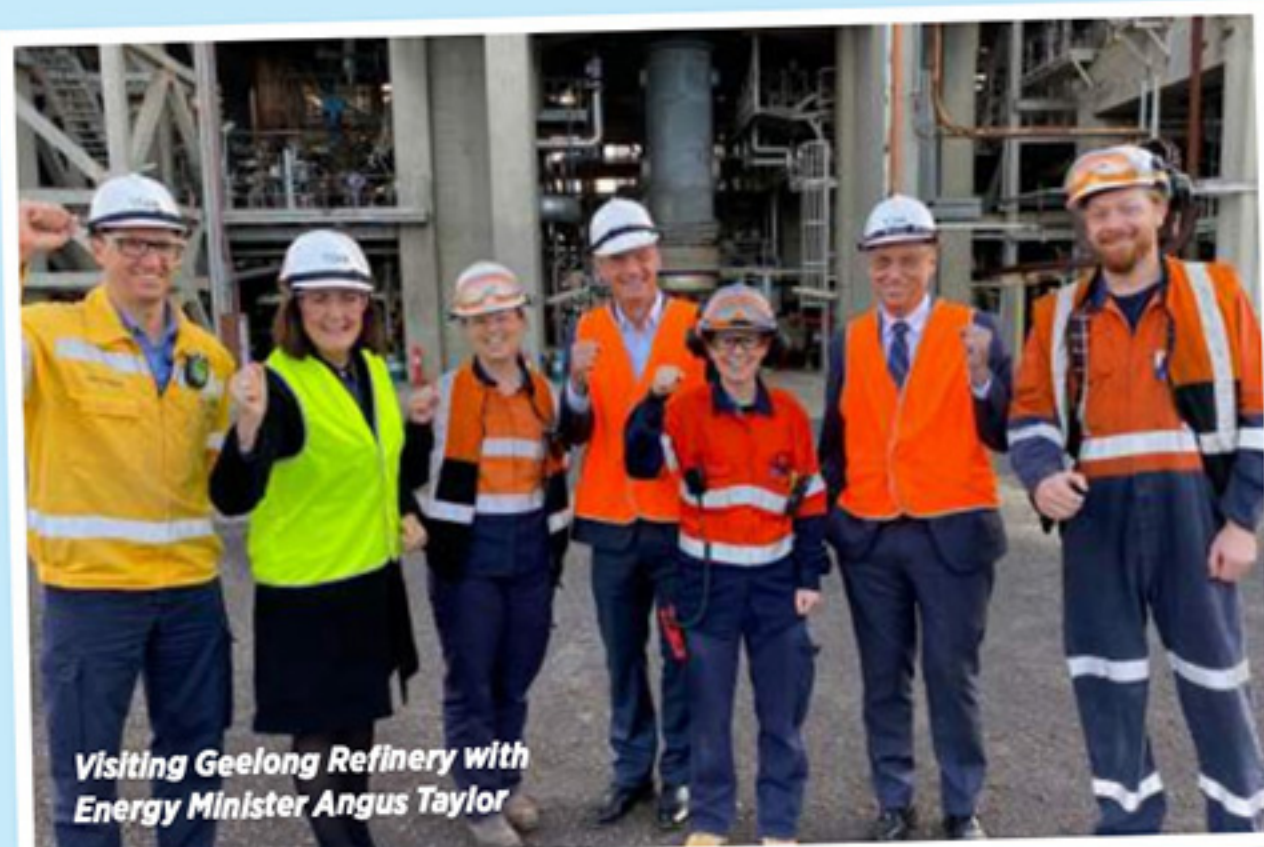
Visiting Geelong Refinery with Energy Minister Angus Taylor