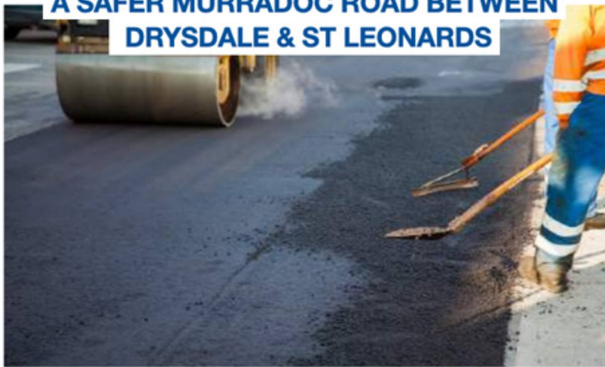
A SAFER MURRADOC ROAD BETWEEN DRYSDALE & ST LEONARDS