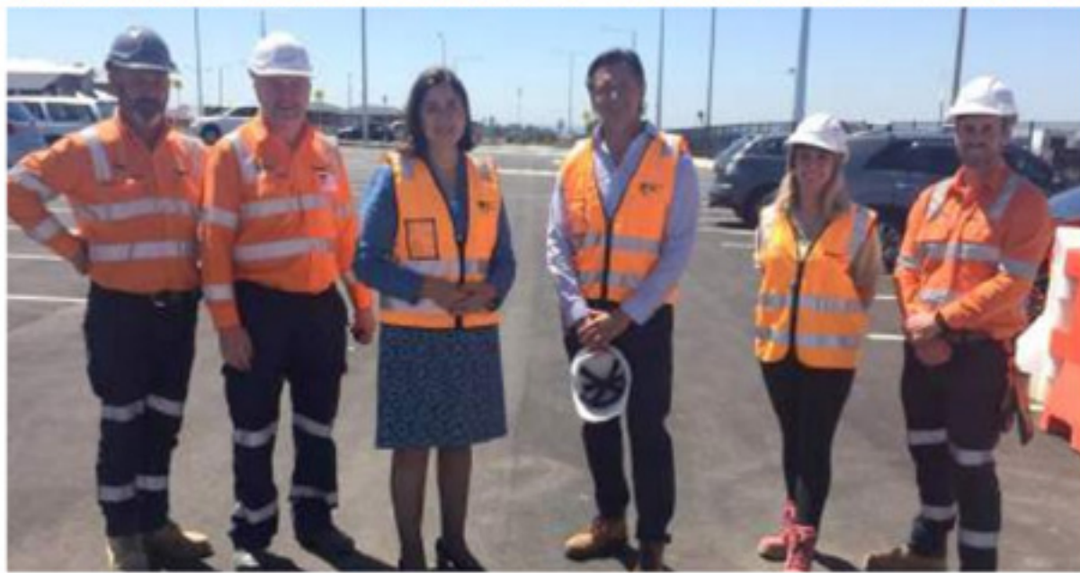
WAURN PONDS STATION CARPARK UPGRADE