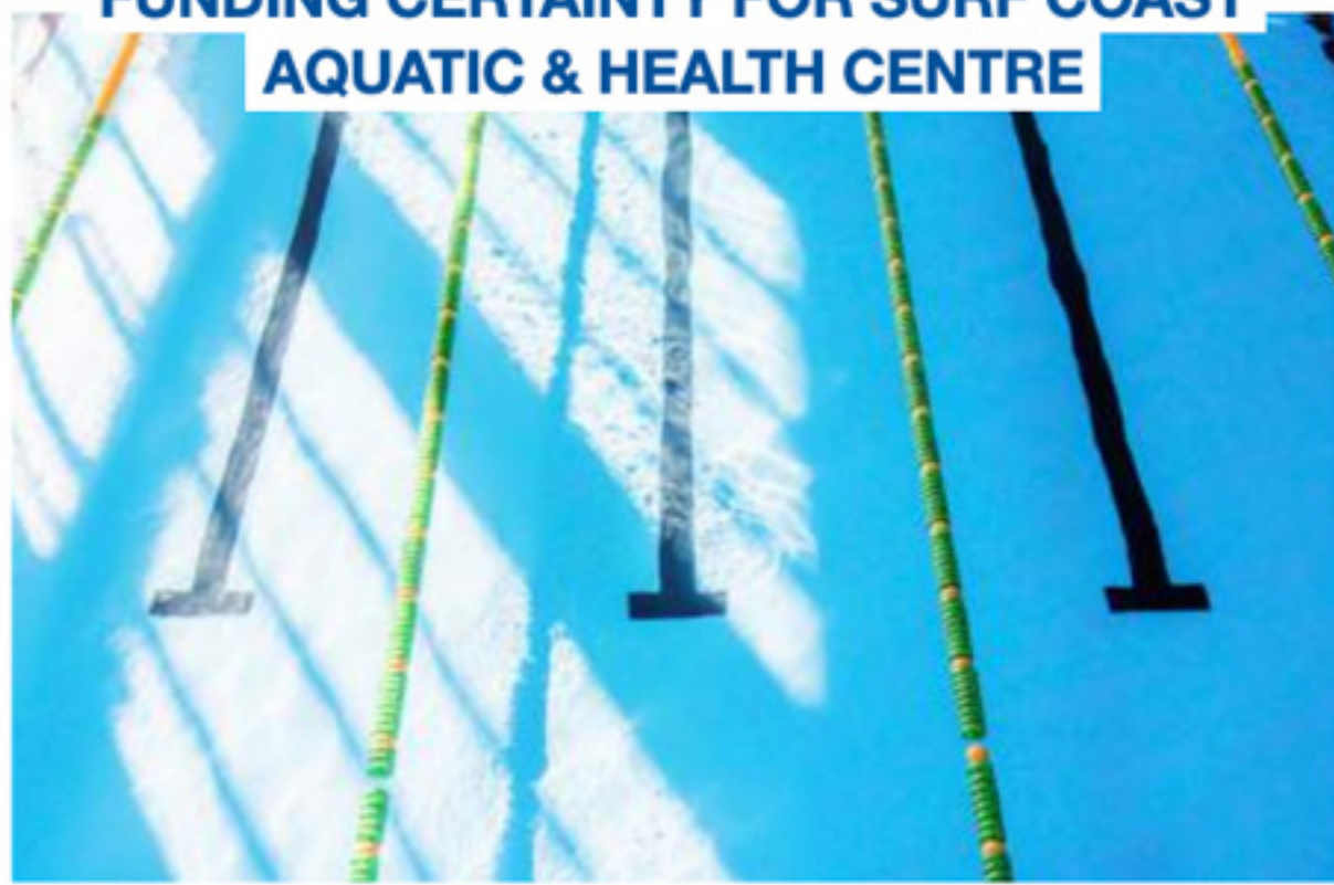
FUNDING CERTAINTY FOR SURF COAST AQUATIC & HEALTH CENTRE