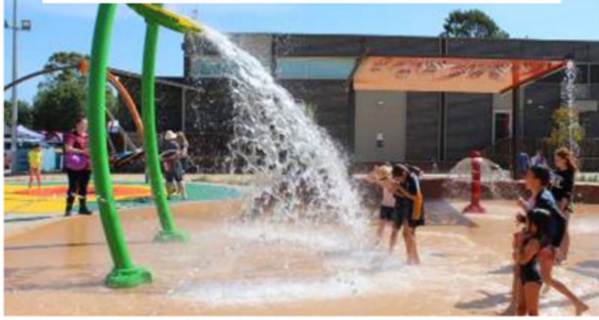
BANNOCKBURN HEART PLAYGROUND