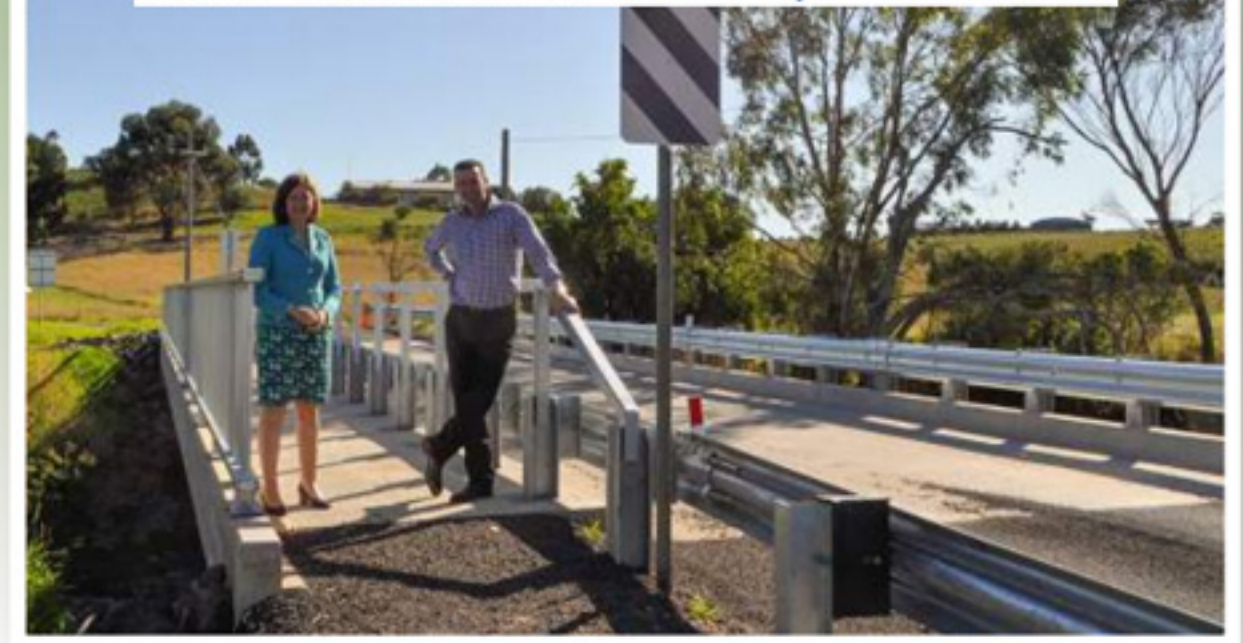
WALL BRIDGE UPGRADE, TEESDALE