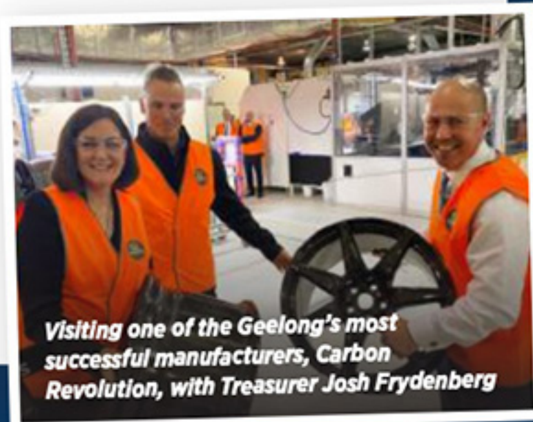
Visiting one of the Geelong's most successful manufacturers, Carbon Revolution, with Treasurer Josh Frydenberg